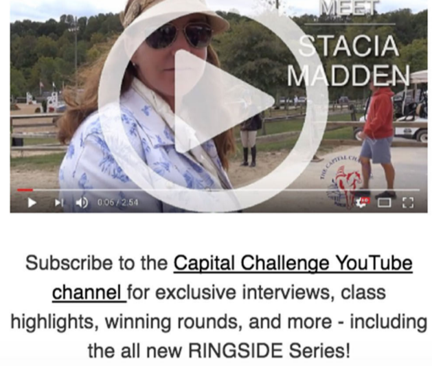
Subscribe to the Capital Challenge YouTube channel for exclusive interviews, class highlights, winning rounds, and more - including the all new RINGSIDE Series!

Join the conversation! Share your own Capital Challenge Horse Show photos using #CCHS2017 or #RiseToTheChallenge for a chance to be featured here or on the official Capital Challenge social media pages!